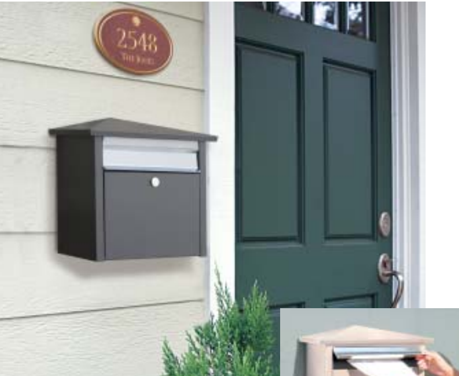
#4750 and custom plaque (#1430) (see pages 66-69) displayed