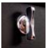
optional thumb latch displayed (#4788 - $10.00)