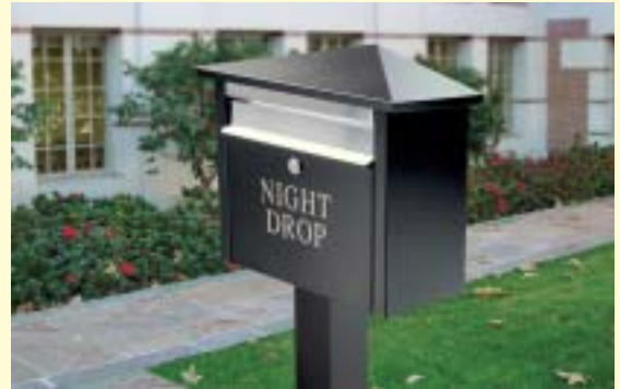
#4750 on standard post (#4795) with custom numbers / letters (see page 71) displayed